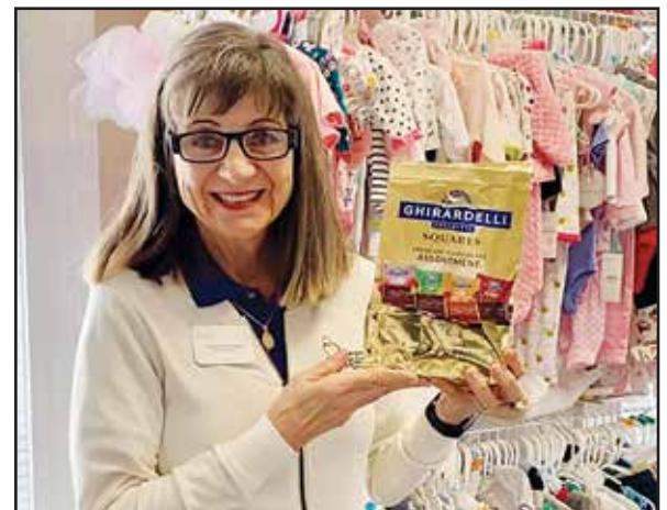
The Gunkle family sweetened our Christmas with these delicious chocolates