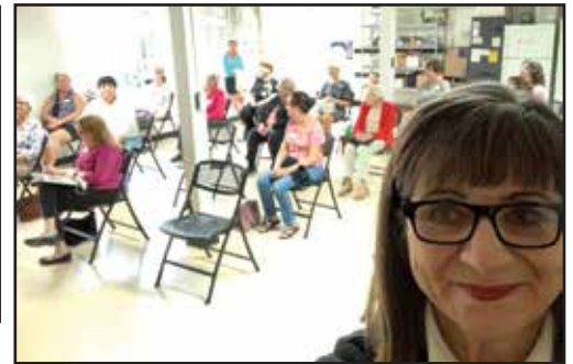
Meeting with the Women's Guild of St. Paul Riverside