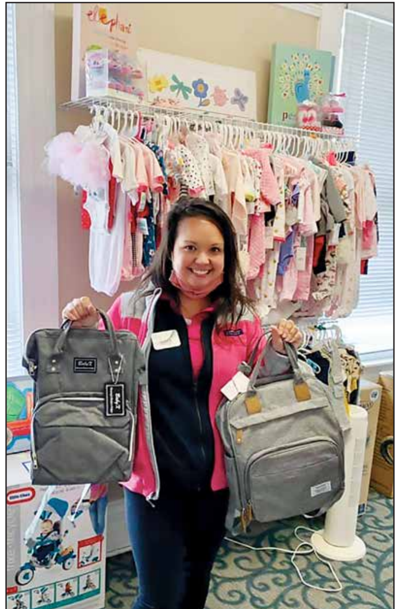
Many responded to our need for diaper bags