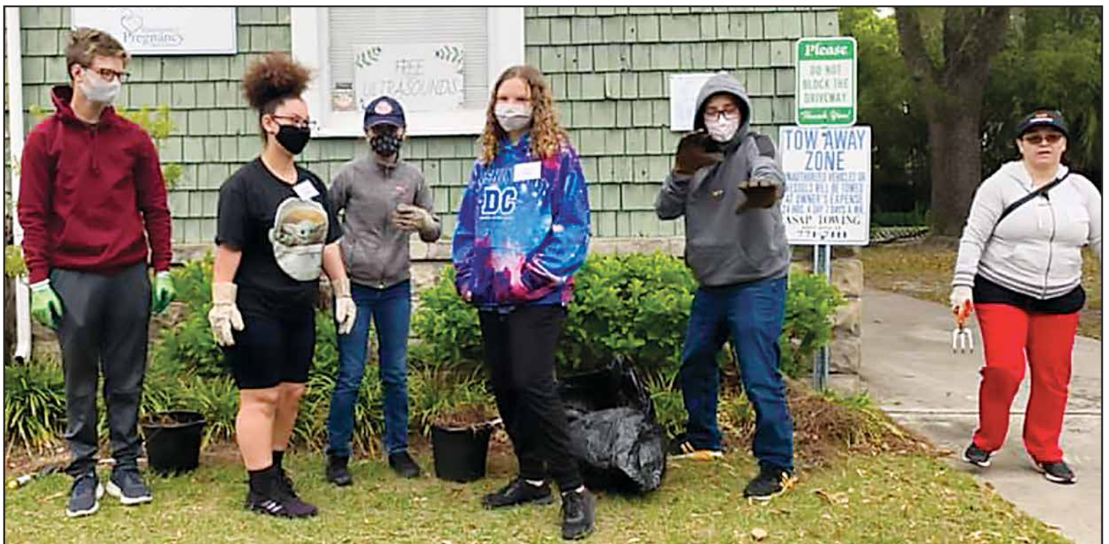
Christ the King Youth Group did a yard clean-up at our Riverside office