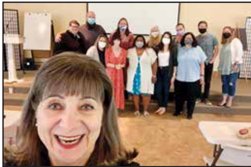
Working with the Youth Directors to discuss forming a Teen Youth Advisory Board for EPS

It takes an entire community to educate, advertise and support the Mission of Emergency Pregnancy Services. As the Bible says: "we are many parts but all one body" (1 Corinthians 12:12)