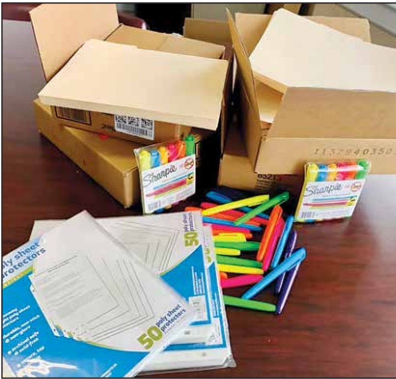
In addition to being a mission, we are a business and we always need office supplies – check out our Amazon wish list on our website www.emergencypregnancyservices.org