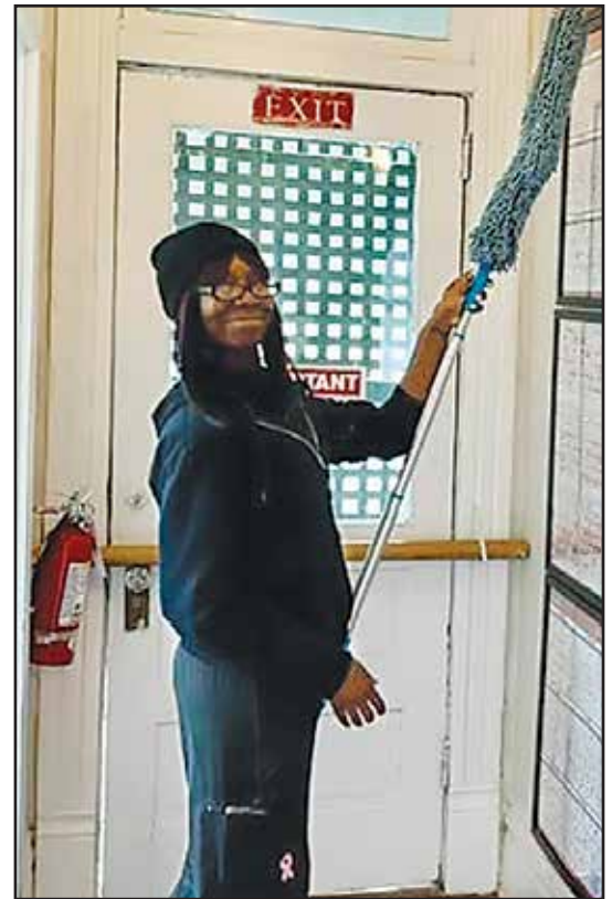
Tempest came to clean, saw our calendars and shared that EPS had helped her with her babies and found one of her due dates on our calendar back in 2015