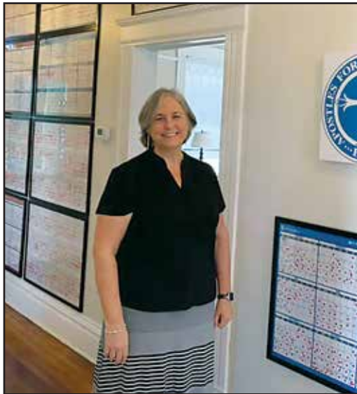
Susan Egan with the Knights and Dames of Malta, American Association

Welcome! May All Who Come as Guests, Leave as Friends.