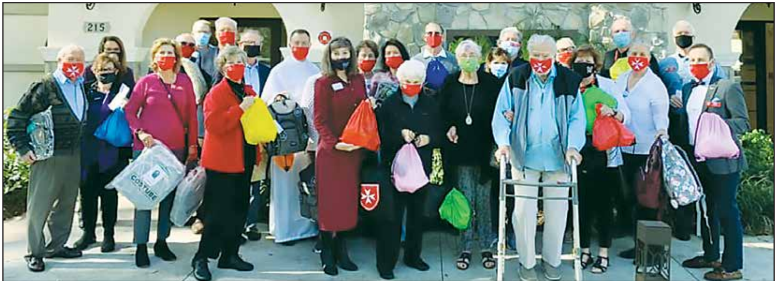
Knights of Malta – American Association – created Mommy Bags