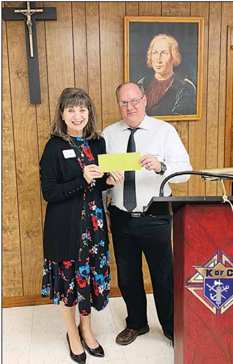
Thanks to Bishop Larkin Council #4727, Knights of Columbus for their faithful support