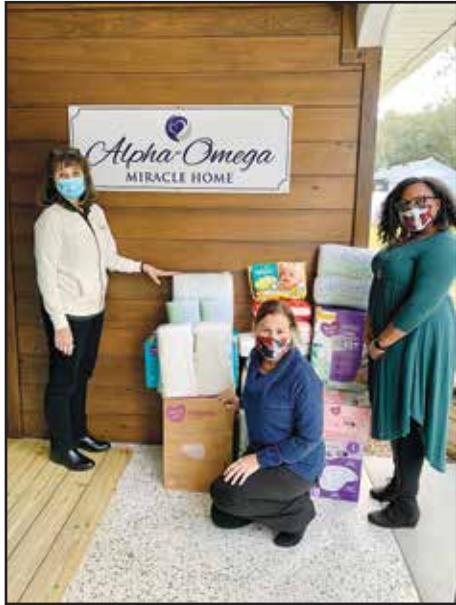
Alpha Omega House

It is so important to ensure the healthy bottoms of the babies and the peace of mind of the moms in our community.