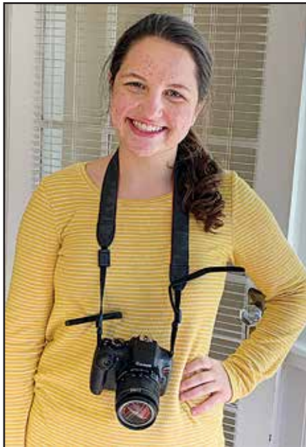
Melissa Gunkle photographed our staff