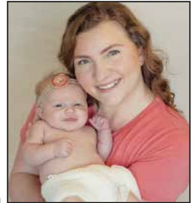
Mommy and baby