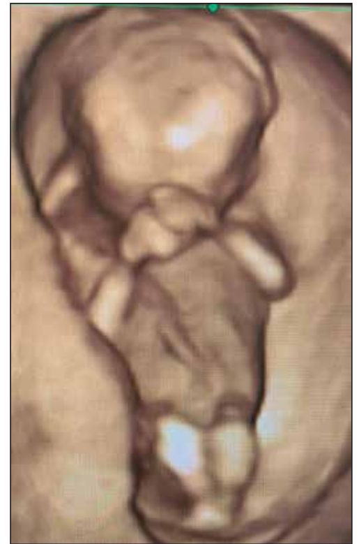
Ultrasound 13 weeks