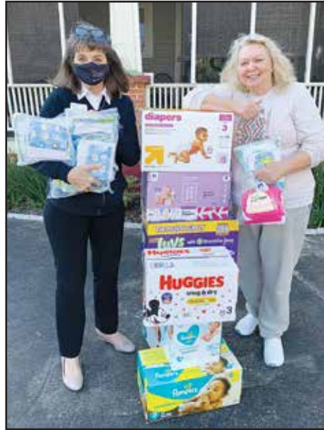
The Inn Ministries