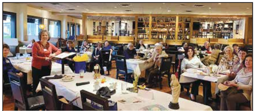
Sharing the EPS Mission with the Catholic Women's Club