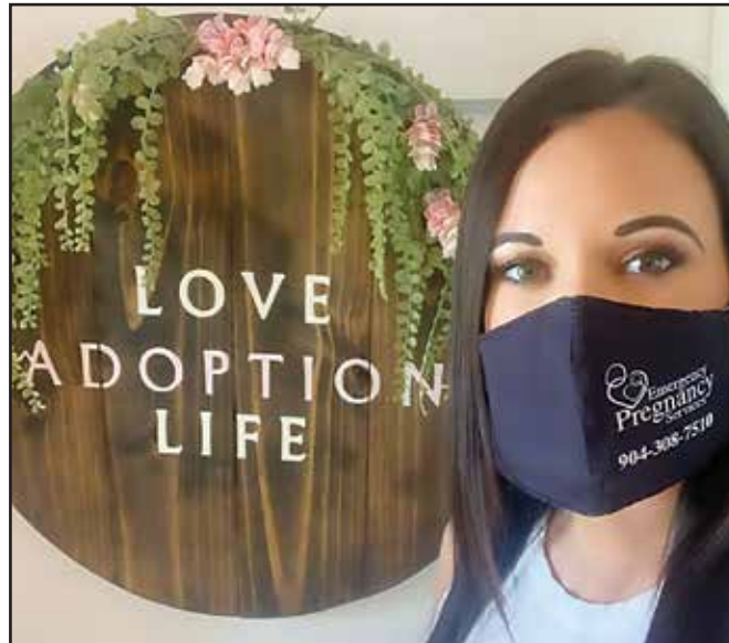
Love Adoption Life