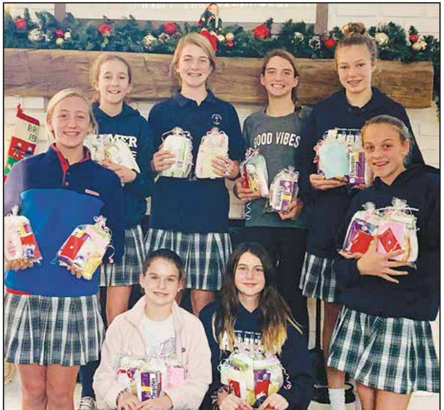
Members of the BLAZE Bible Study group from Our Lady Star of the Sea created 18 Mommy Bags