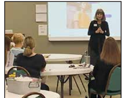
San Juan del Rio Council of Catholic Women for inviting us to share our Mission