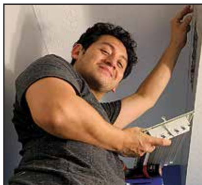
Angel Corrales painted our client restroom