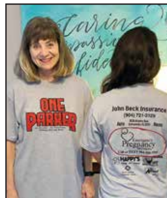
Terry Parker High School (near our Arlington office) who invited us to sponsor their sports "T" Shirts