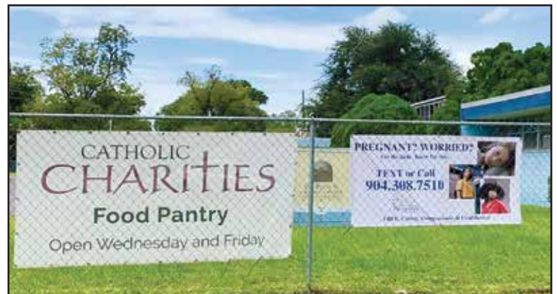
Partnering with Catholic Charities at St. Pius Church