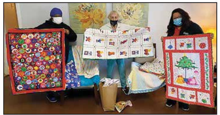
Ladies of the St. Therese Circle of St. Paul's Church in Jacksonville Beach made baby blankets